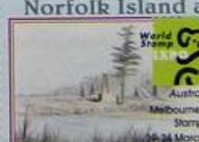
Norfolk Island at

Designed & Printed by Photopress International, Norfolk Island