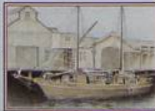
Norfolk Island 45c