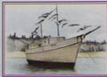
Norfolk Island 45c