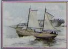
Norfolk Island 45c