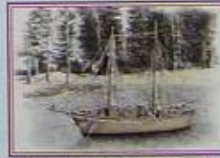
Norfolk Island 45c