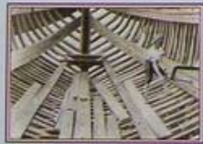
Norfolk Island 45c

"History of the Resolution" Norfolk Island